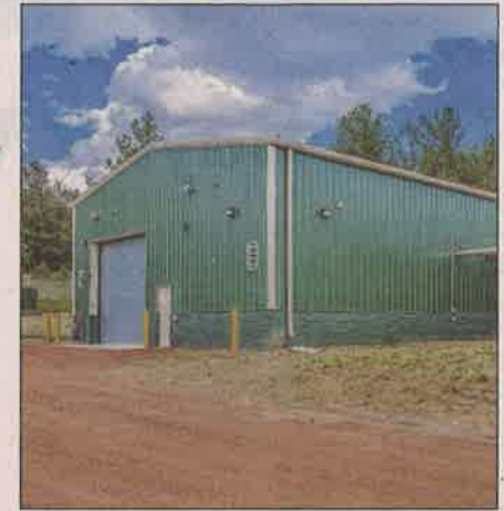
The new wastewater treatment plant in Florissant is a $2.5 million project funded by the Colorado Department of Public Health and Environment and the Department of Local Affairs.

BY PAT HILL pat.hill@pikespeaknewspapers.com